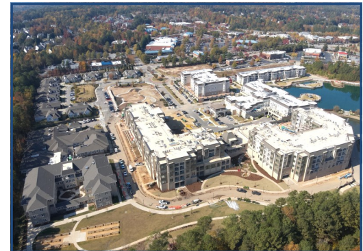
Searstone Retirement Community—

ALCALA Construction Management, Inc. is committed to making our clients successful utilizing our best efforts, leadership and expertise. We believe in taking a pro-active approach, and pledge to provide our services professionally, diligently, and with high integrity.