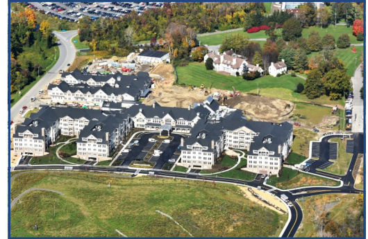
Purchase Senior Learning Community—