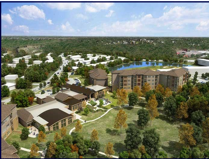
JKV Courtyards and Meadows—Kansas City, MO $82M