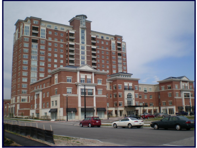
Harbor's Edge CCRC - Norfolk, VA $120M