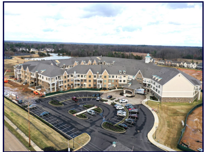
Farms at Bailey Station—Memphis, TN $219M